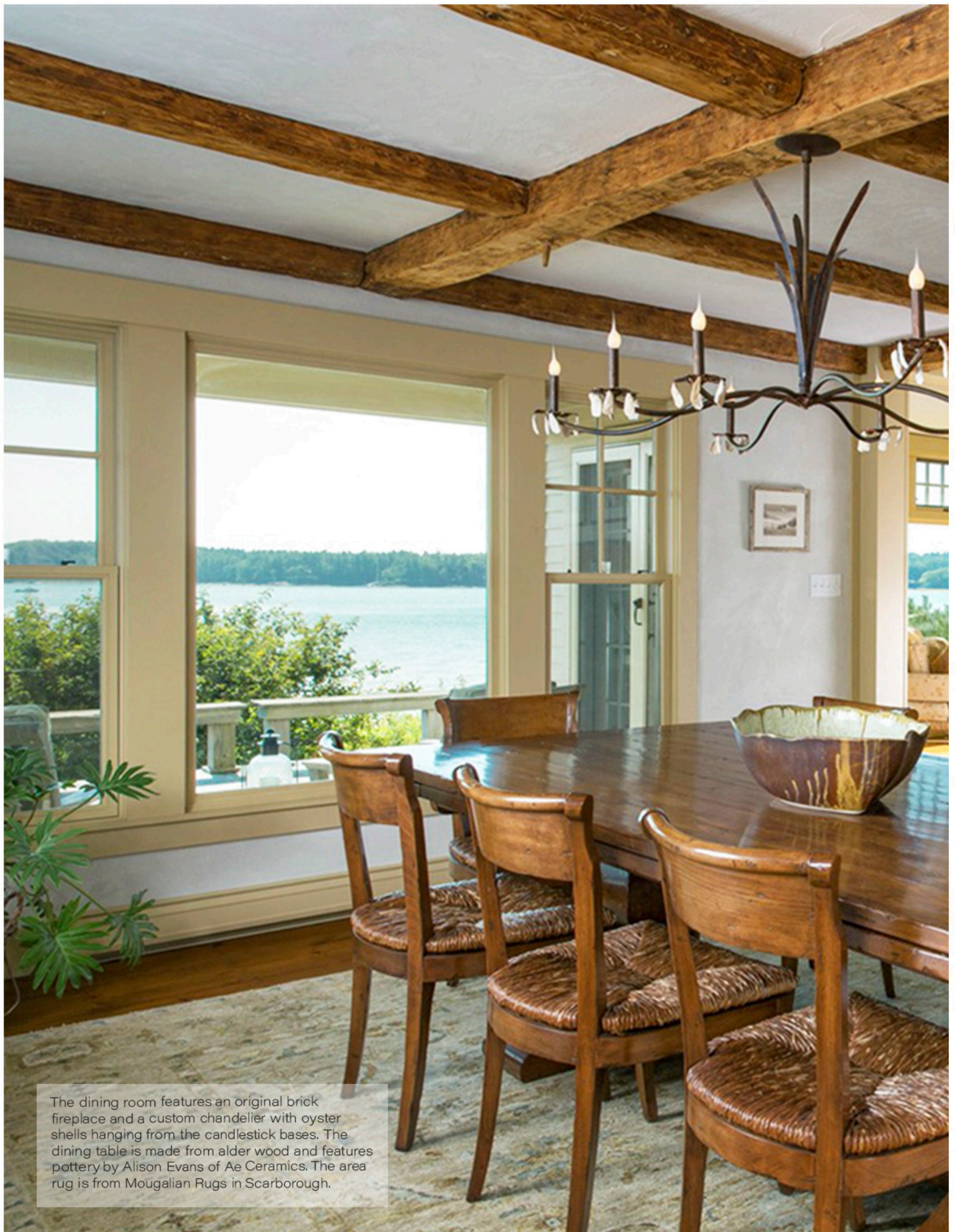
The dining room features an original brick fireplace and a custom chandelier with oyster shells hanging from the candlestick bases. The dining table is made from alder wood and features pottery by Alison Evans of Ae Ceramics. The area rug is from Mougalian Rugs in Scarborough.